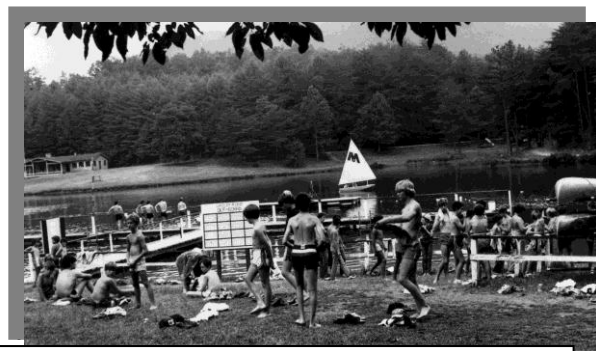
CRM waterfront circa 1970