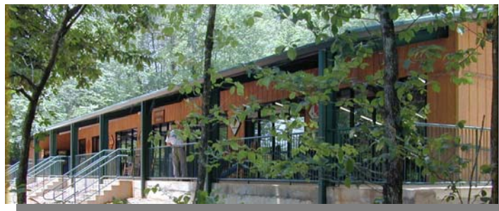
H. Randolph Holder Dining Hall

Need more info? Call the Food Service Director at 706.782.6617 or email emkeefe@yahoo.com between June 1 st and the close of camp, or the Service Center at 1.800.699.8806.